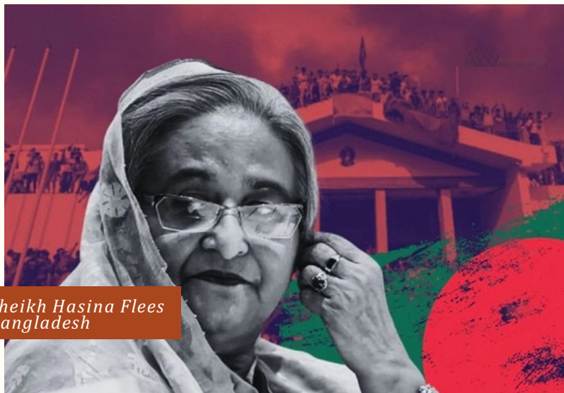
Sheikh Hasina Flees Bangladesh

Ms Hasina's allies said she would not return to the country's politics.